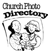
Photo Directory Update